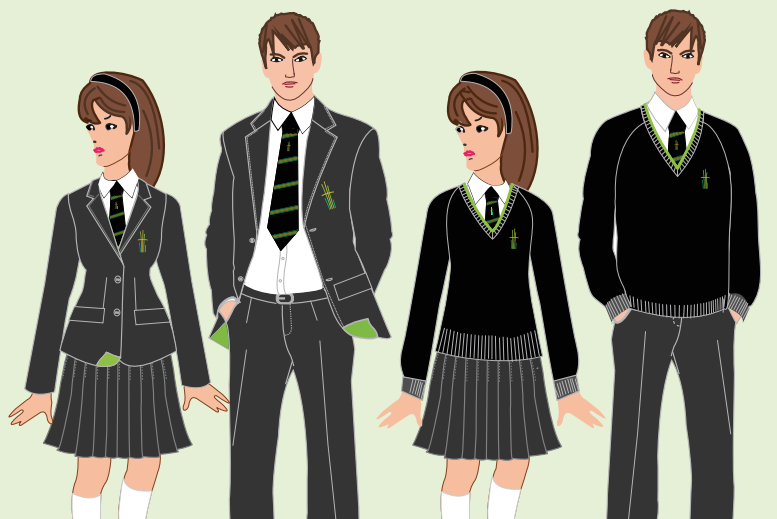
Concept 1: Grey blazer with green lining. Black jumpers with apple green trim. Grey trousers and skirts.